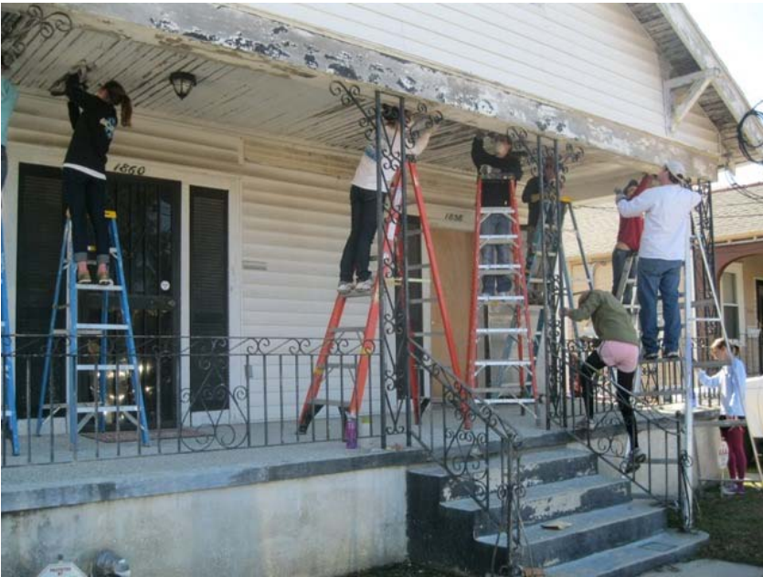
Scraping and sanding