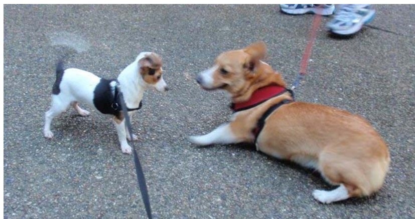
Annie and Bilbo get some 'face time'

Nearly 30 dogs and cats attended the Blessing of the Animals on Sunday afternoon, along with almost 40 owners and pet lovers. The weather was beautiful, the animals were well-behaved, and so were the people!