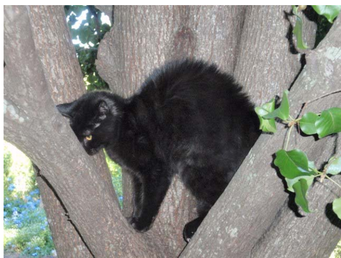
Finzi is not thrilled about the ratio of dogs to cats