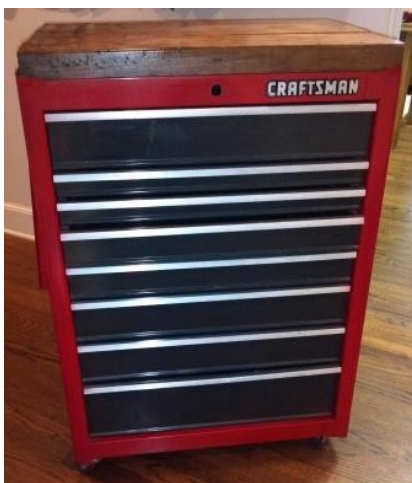
Craftsmen tool cabinet