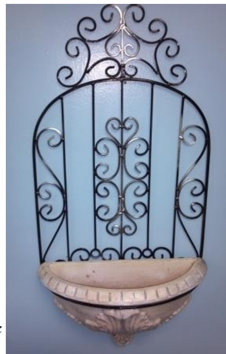
An iron and faux concrete wall planter