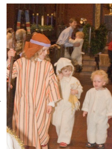
Christmas Pageant, 2008

The last practice for the Christmas Pageant will be held this Sunday, Dec. 18, during the Sunday School hour. Please meet in Stirling Hall at 9:15 and everyone will go to the church together. We still need sheep and shepherds for the pageant, so come even if you have not previously signed up!