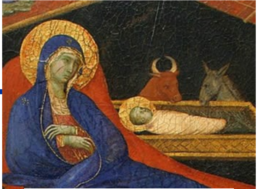
The Birth of Christ , c. 1308, by Duccio di Buoninsegna