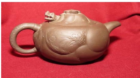
Antique Chinese teapot