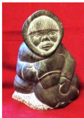
Authentic Eskimo soapstone statue