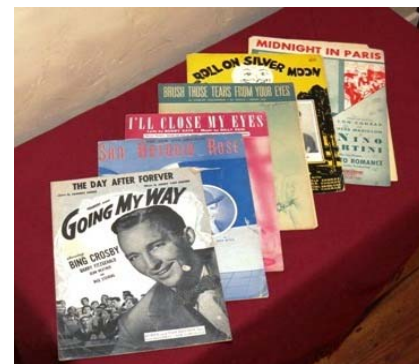
Original sheet music from the '30s and '40s

Our next week to host guests from Family Promise will begin on Sunday, Nov. 30. Please mark your calendars now for this important ministry. Signup information will be sent out later in the month.